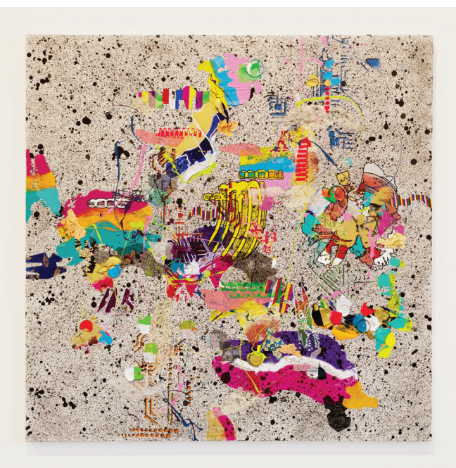
Cold Logic, 2023, Mixed media on canvas, 36 x 36" (left) Static Memories, 2023, Mixed media on canvas, 36 x 36" (right)