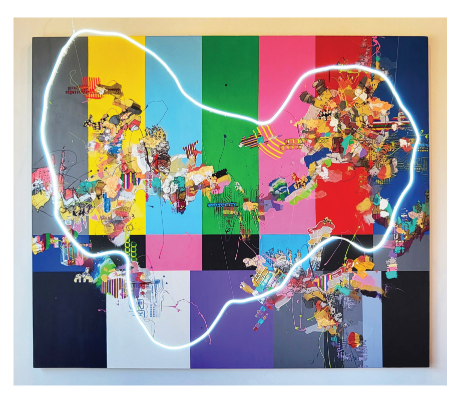
Analogous Alchemy, 2023 Mixed media on canvas, 60 x 72"

The hazy atmosphere of Imperium brings to mind a cosmic landscape within the motherboard of memory, where some features (moments) are indistinct through the fog (distance). This space allows room for exploration (reflection) not just beyond the screen but backwards in time. The result is an otherworldly image which strikes a note of comparison between outer space and the space within: beyond the screen, in the guts of a deep vintage television, or better yet, beyond the screen of our eyes, in the depths of the mind. Flowing chunks of massively thick brushstrokes mimic the look of a jet stream flowing across an expansive continent.