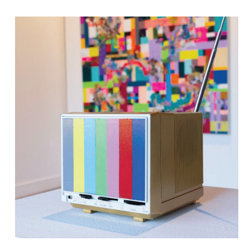
Nostalgic Verticals, 2023 Spray, acrylic paint on found object, 6 x 5.2 x 5.5"

Imperium is twelve feet of meandering pathways which make their way across organic color fields. Lee's distinctive use of contour line becomes a layer on top of loosely painted strokes, defining them as shapes, not gestures, lending a graphic quality to what would otherwise read as painterly abstraction. It is masterful how the key element of value is so carefully considered amidst the chaos. Finding balance within multiplicity is a unifying component of the work throughout the show.